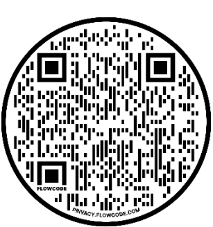
Scan the QR code for an introduction video!