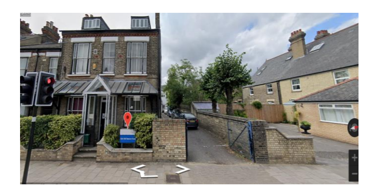
RCE Wellbeing Hub, 128-130 Tenison Road, Cambridge, CB1 2DP