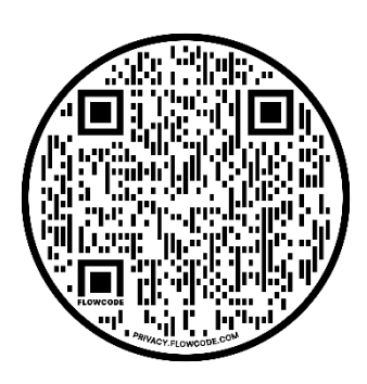
Scan the QR code for an introduction video!